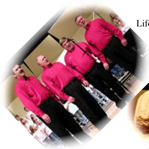
Life of Riley