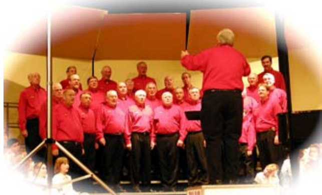
Melody Men Chorus

More Pictures at http://www.melodymenchorus.org